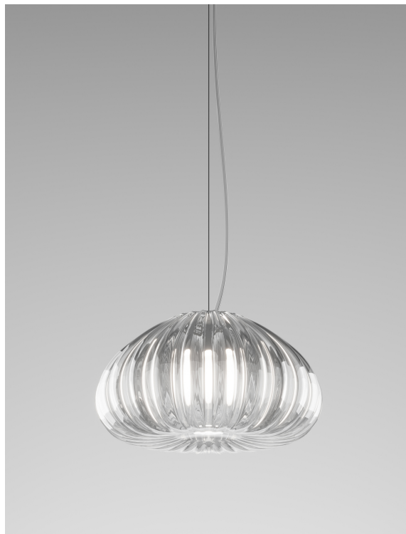
DIAMA SP G CR NI E27 CE